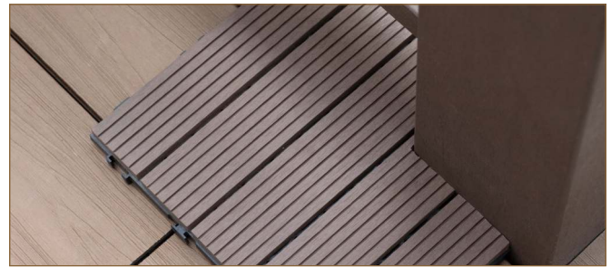
Place the tile to lock around walls and pillars